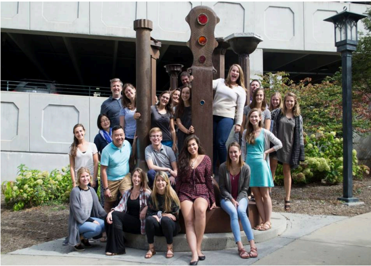
Pictured above is the Fall 2016 CMHC cohort