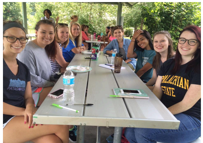
Pictured below are members of the PSC cohort